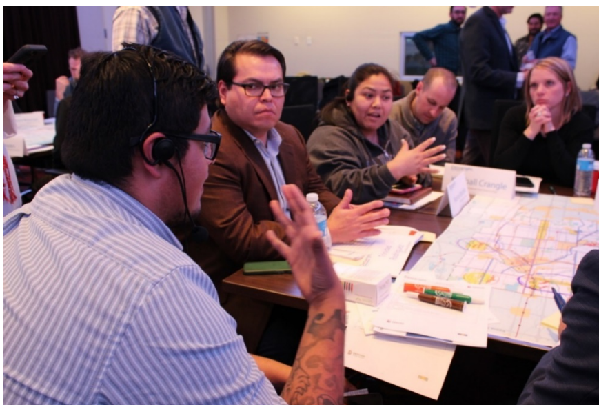
Small group break out discussion

http://www.denvergov.org/content/dam/denvergov/Portals/Denverright/documents/Blueprint/Meeting%20Archive/BPTF_Meeting_5_120816.pdf